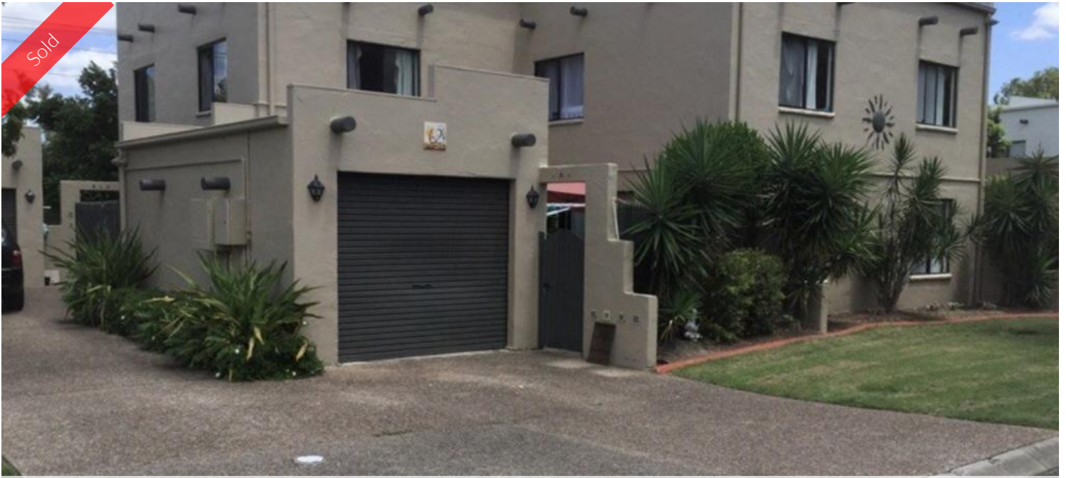
Unit 62, 61 Harburg Dr, Beenleigh